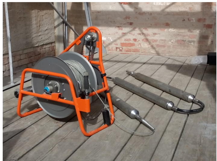
P-wave source SBS1000 Magnum with winch.